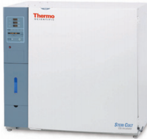
figure 1–Steri-Cult CO 2 Incubator with Class 100 Air

Class 100 air is achieved and maintained within the Series II Water Jacketed, Steri-Cycle, Steri-Cult, and Steri-Cult R CO 2 Incubators by way of our advanced incubator design and HEPA Filter Airflow System.*